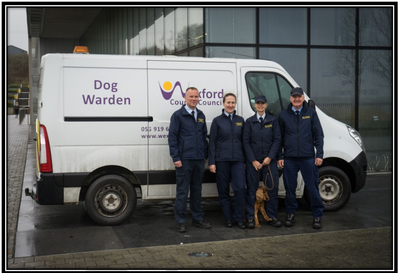
Wexford County Council Environment Section Wardens

Enforcement of all relevant legislation is a key priority for Wexford County Council's strategy to deal with litter. The Council is fully committed to enforcement of the Litter Pollution Acts 1997, as amended and the Waste Management Acts 1996, as amended and all other relevant legislation or bylaws.