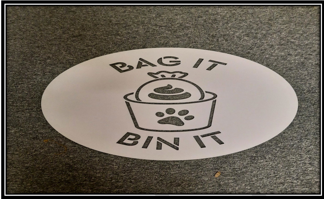
Dog fouling Stencil used by Wexford County Council for its "Bag it Bin it" Campaign.