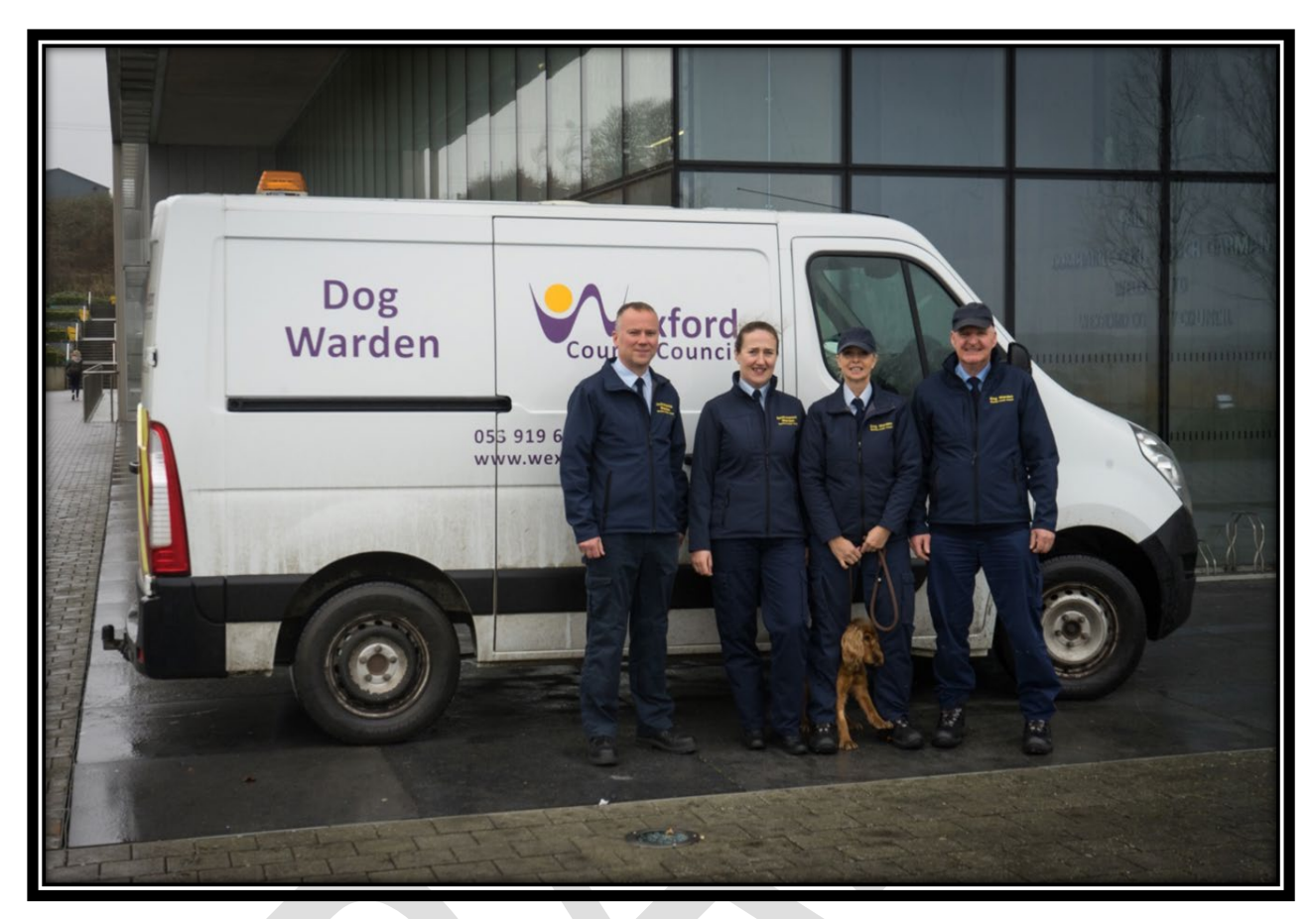
Wexford County Council Environment Section Wardens

Enforcement of all relevant legislation is a key priority for Wexford County Council's strategy to deal with litter. The Council is fully committed to enforcement of the Litter Pollution Acts 1997, as amended and the Waste Management Acts 1996, as amended and all other relevant legislation or bylaws.