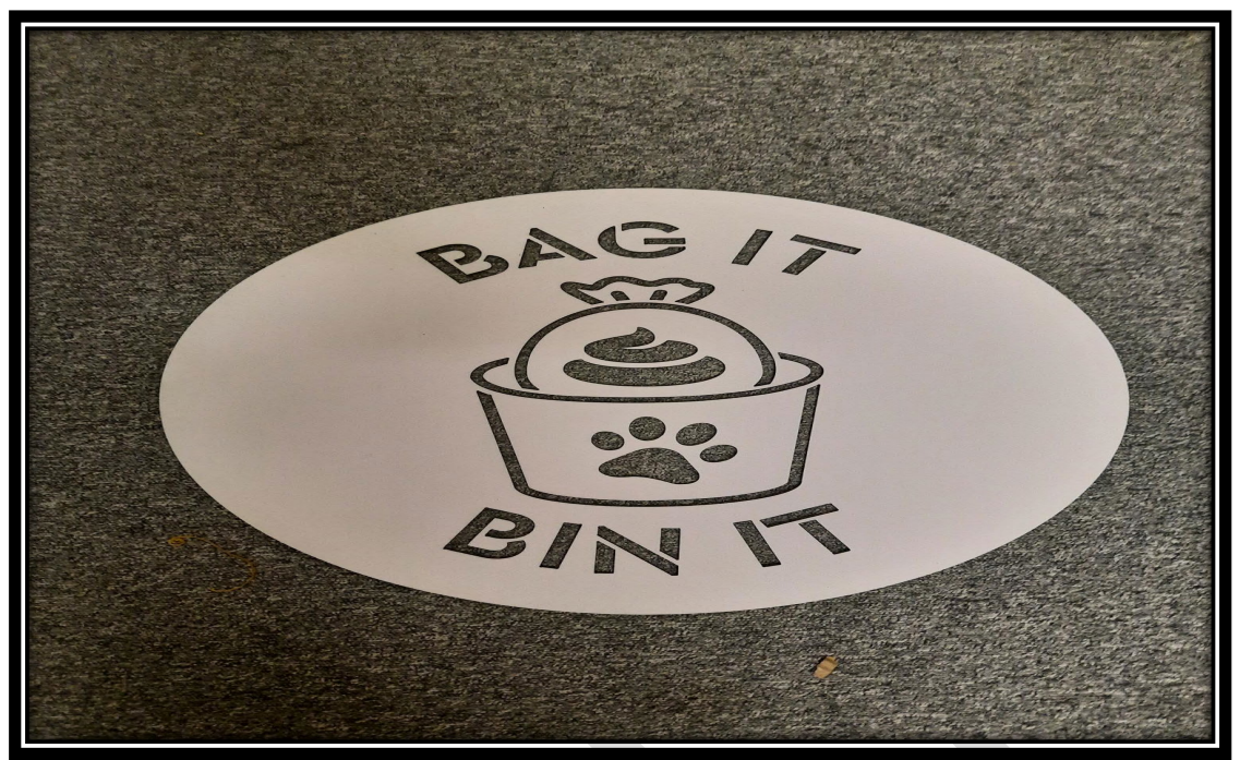
Dog fouling Stencil used by Wexford County Council for its "Bag it Bin it" Campaign.